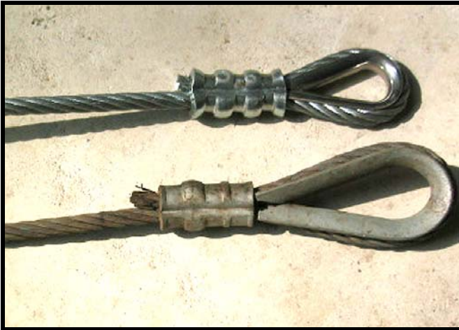
Compare the shiny new cable and thimble to the rusty weathered example.

coax line. But with the convenience of a crank-up tower also comes some additional maintenance that, if not performed, can place the tower and the operator in harm's way.