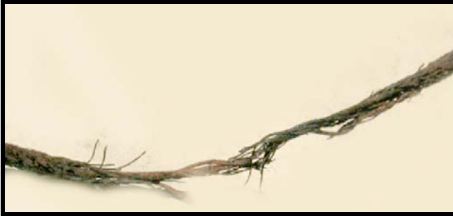
A rusted and frayed cable.

It's pretty nice when you don't have to climb your tower to perform maintenance on antennas or change out a