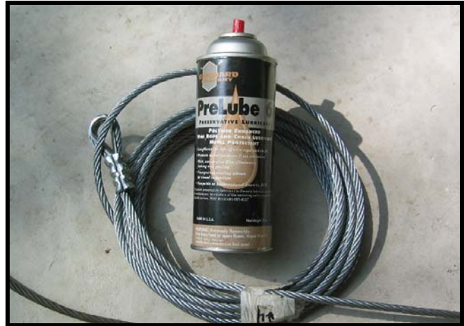
Preserve and lubricate those cables.

There are some cable maintenance products that help extend the useful life of these cables, in particular, the crank