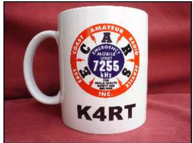
ECARS custom ceramic 10 ounce coffee mug