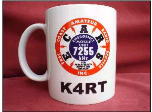
ECARS custom ceramic 10 ounce coffee mug

Jackets will be dropped shipped by the manufacturer directly to you. Any overpayments in shipping will be applied to the set-up fee. Order issues should be addressed directly with the Galls, Inc. Make checks payable to: ECARS PO Box 5923 Hudson, FL 34674