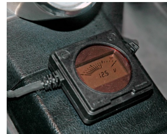
The Battery Bug mounted on my motorcycle

Installing the Battery Bug is easy. Attach the provided Velcro strip on or near the battery and then stick the Battery Bug to the Velcro. Attach the leads to the battery and wait one minute for the Battery Bug to activate.